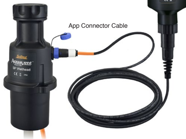
App Connector Cable